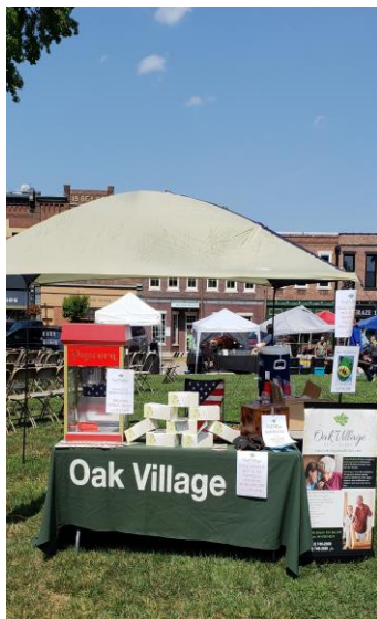
Oak Village Healthcare Booth set up!