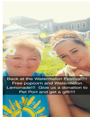
Back at the Watermelon Festival!!!! Free popcorn and Watermelon Lemonade!!!! Give us a donation to Pet Port and get a gift!!!!