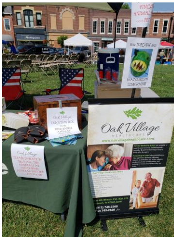
Free gifts and donations to the Pet Port!