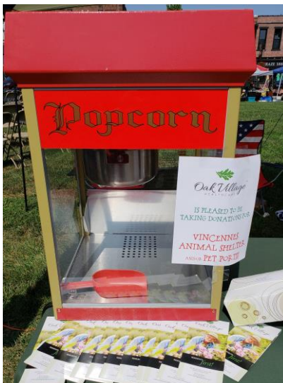
Popcorn machine we rented from Valley Party Supply. The popcorn was delicious! We had mixed feelings about the Watermelon Lemonade ☺