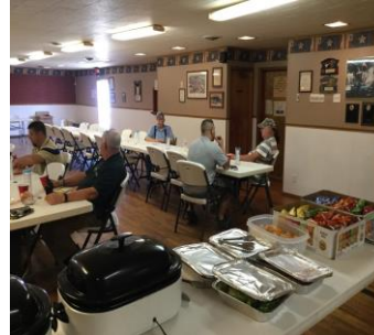
VFW members getting in on the fun!