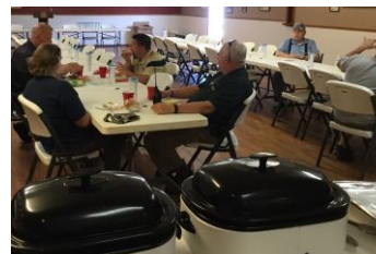
Enjoying some socializing between departments.