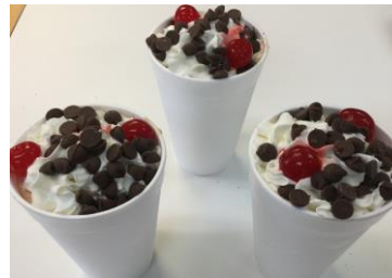
They were DELICIOUS!!!!