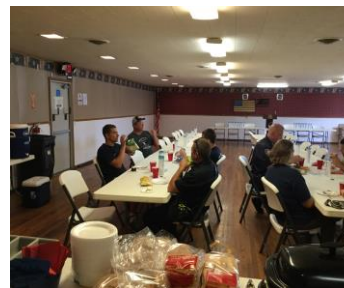
Local Heroes enjoying the food and community spirit!!!