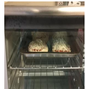
Cathie, AD made English muffin cheese pizzas from scratch and they were delicious!